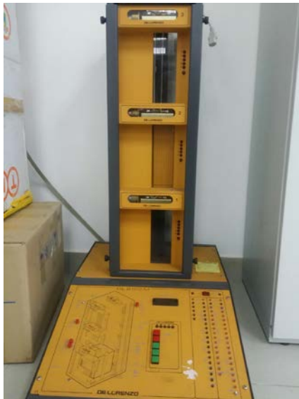
DL 2122M Lift Model