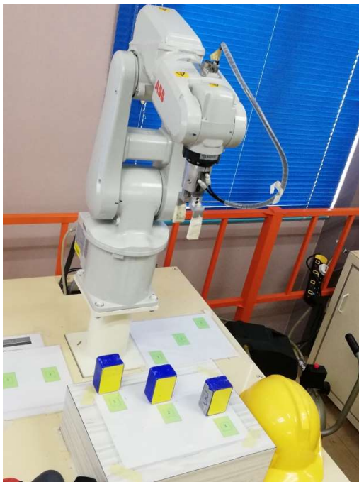
(a) ABB IRB 200

MoveC – to move the tool centre in circular path