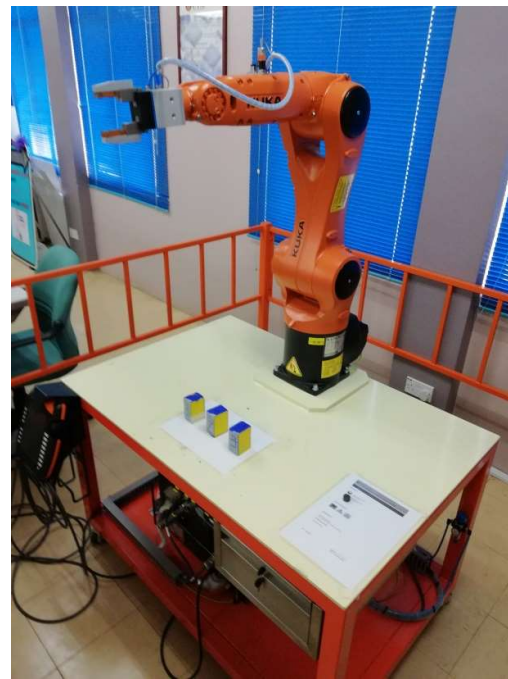
(b) Kuka KR 6 R900 sixx